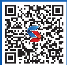
Stanol Myanmar Mandalay Page